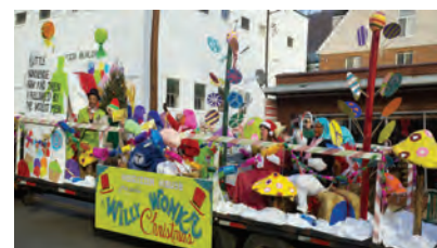
Horizon House 2011 Christmas Parade Float

Horizon House members react with great pride concerning this project. "While riding on the float, I love to see the children